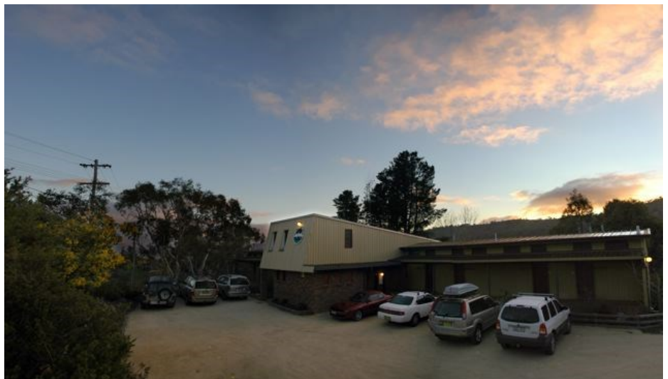
Jindabyne Lake Lodge

PO Box 664 West Ryde NSW 1685 www.snowcountry.com.au info@snowcountry.com.au