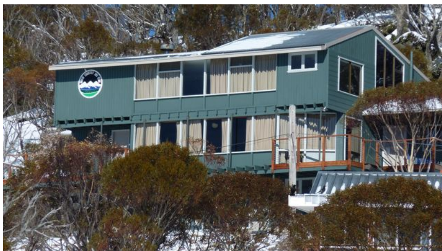
Snow Country Smiggins Holes Lodge

PO Box 664 West Ryde NSW 1685 www.snowcountry.com.au info@snowcountry.com.au